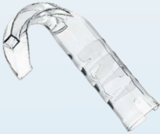
Pediatric Size 2 Part Number: YLO-III B2