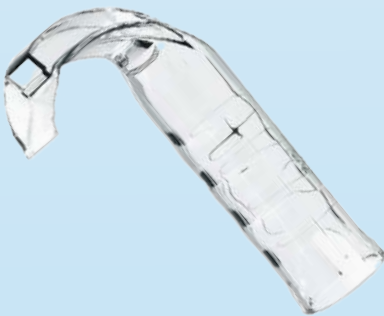
Large Adult Size 4 Part Number: YLO-III B4