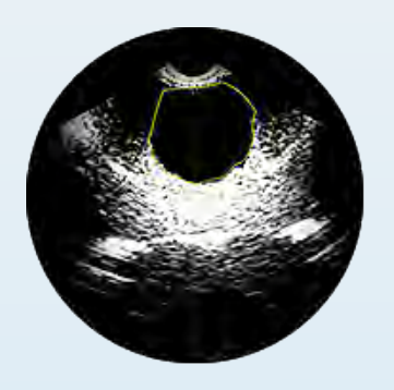
Expert Mode (Displays an Ultrasonic Image)