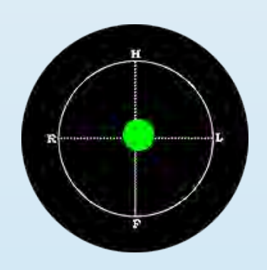
Intelligence Mode (Displays a Real-Time Bladder Scan Projection Position)