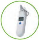
Infrared Ear Thermometer