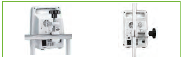
Bed Rail Clamp